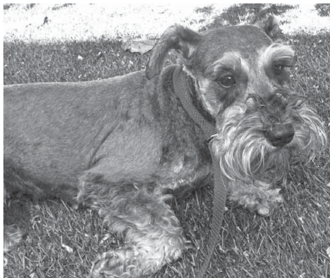
Mandy was also rescued from an abusive situation and needs lots of love.

For a 6-year old, female, purebred Miniature Schnauzer, I've really been shuffled around. Let me introduce myself, I'm Gwen and I've resided in at least two - maybe three - shelters in my lifetime. The most recent time when I was brought in as a stray, the LA county shelter contacted my owner. They decided they didn't want me any more so I spent two weeks at the shelter before being rescued. The whole time I was in the shelter, I couldn't figure out why they didn't want me. I love people, have a great temperament, get along great with other dogs and I'm not very big - only 13 pounds. I do have impaired