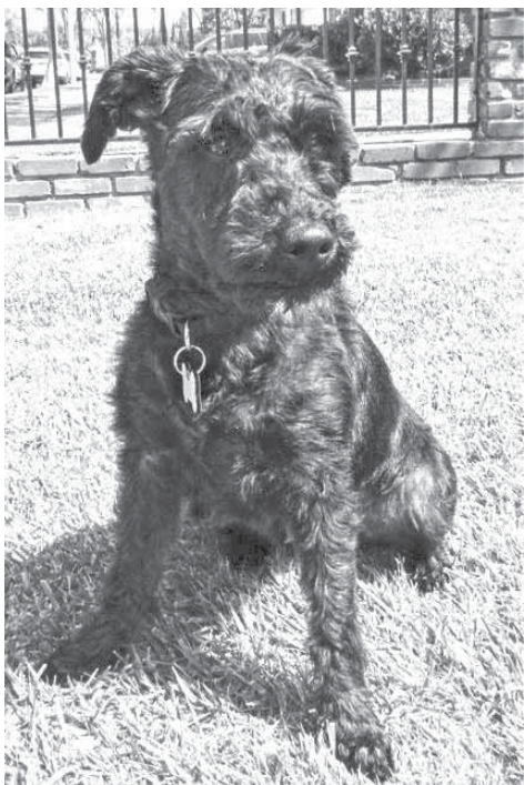
Victoria is looking for love after her rescue.

We are looking for volunteers to help with our Saturday pet adoption events which are held at the Petco located at 537 N. Pacific Coast Highway Redondo Beach 90277. If you are interested in volunteering and can commit to at least one Saturday a month, please contact us at info@msfr.org