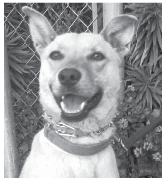
Cayenne is a Lab & Jindo mix and would like to be a single dog with an owner who likes to play.

If you have any questions about a particular dog's availability you can email us at info@msfr.org . Please visit all of our Miniature Schnauzers & Friends rescues at the adoptions fair held every Saturday from noon-3:30 p.m. or check out our website, www.msfr.org . Our adoptions fairs take place at Petco, 537 N. Pacific Coast Highway, Redondo Beach, California. Schnauzers! Bet you can't adopt just one! •