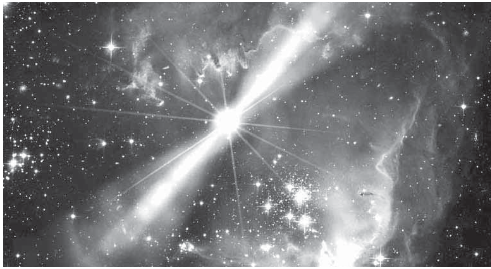
An artist's idea of what a star might look like as it emits a "gamma burst" just before collapsing.